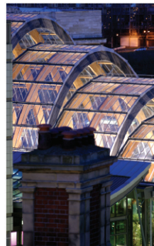
Winter Garden from Above