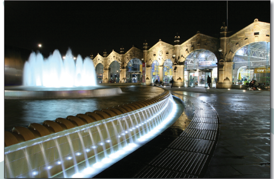
Sheffield Railway Station