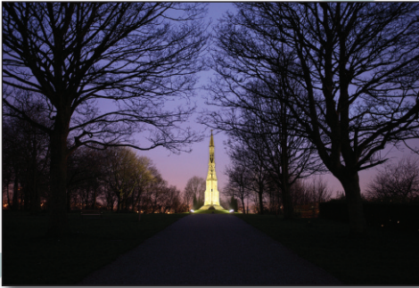
Cholera Monument Grounds