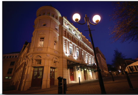
The Lyceum Theatre